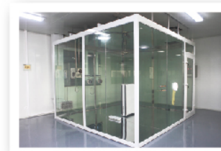
30m 3 Test Room

Thenow R&D center have more than 50 experienced and professional engineers. Many of them have more than 10 years industry experiences. Meanwhile, Thenow jointed Shanghai Jiaotong University and Stanford University, setting up academic research center preparing talents and technical reserve. And we established a series of professional laboratories: enthalpy difference lab, 3m 3 cabin (test noxious gas and microorganism), 30m 3 (test performance of machine), Noise lab, wind tunnel lab, high and low temperature lab, aging lab, nanometer dust lab etc.