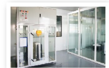
3m 3 Test Room